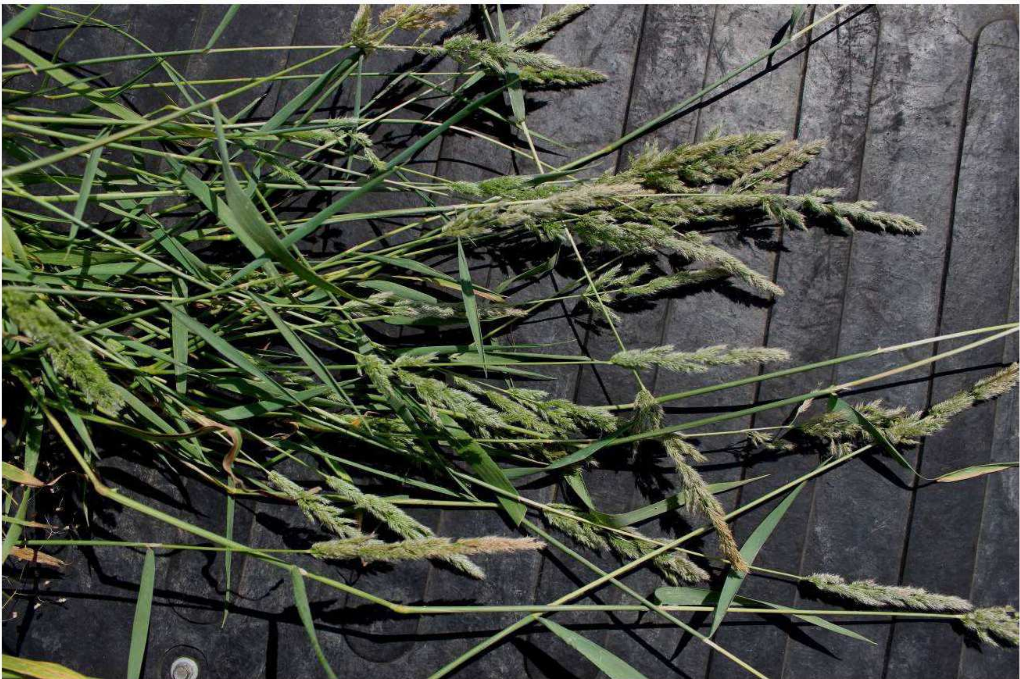
Figure 4. Polygogon interruptus (Poaceae).